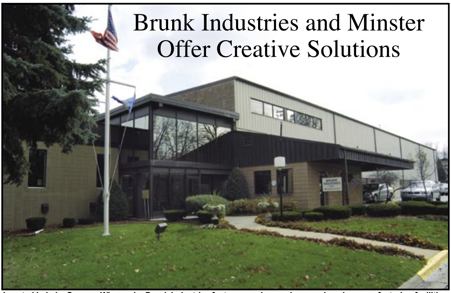
Located in Lake Geneva, Wisconsin, Brunk Industries features modern and comprehensive manufacturing facilities.

Brunk in 1960, Brunk Industries has grown from a tool and die shop in the family garage to a world class manufacturer of precision metal stampings and assemblies.