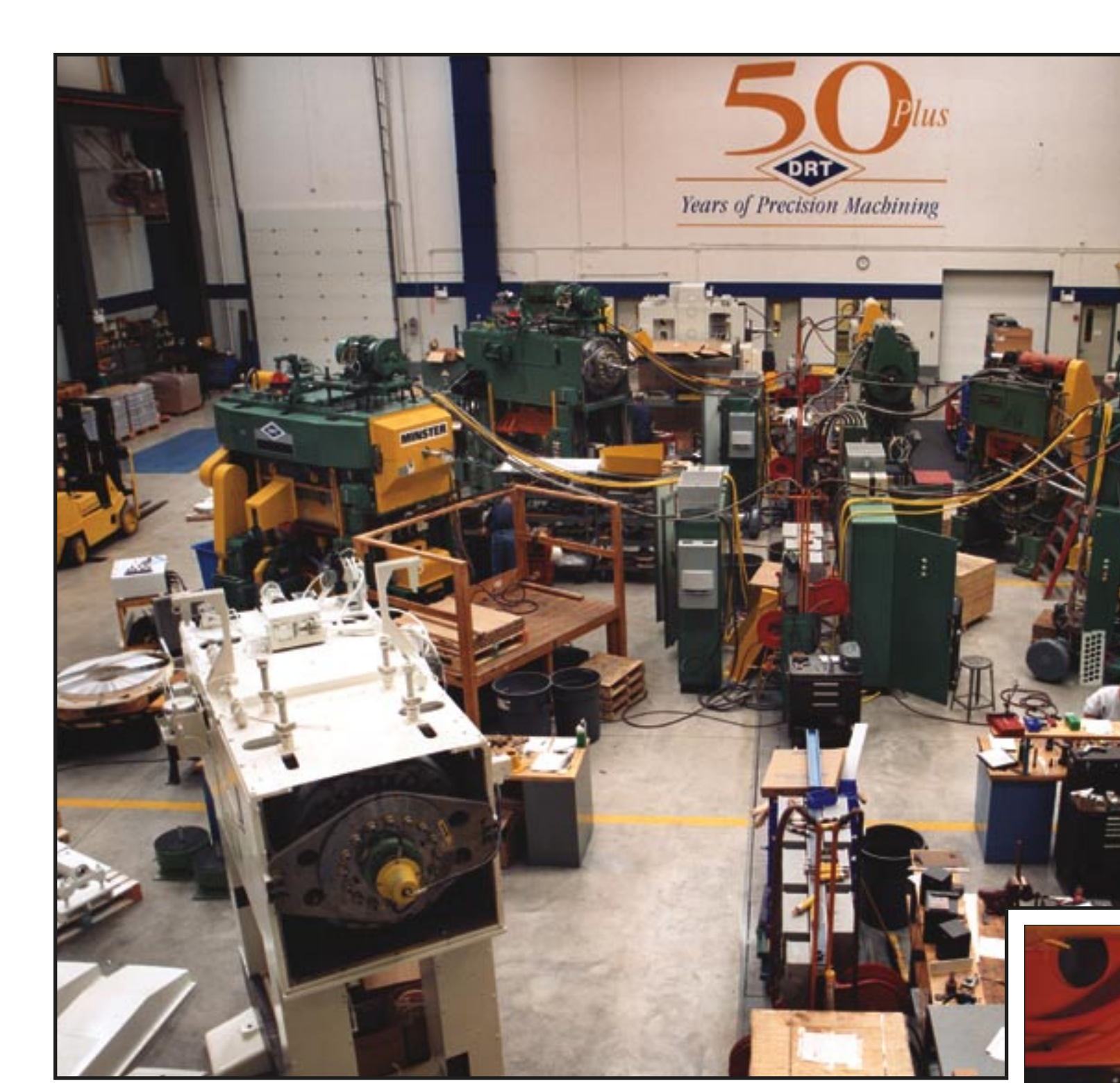
High speed conversion systems under construction on the assembly floor at Dayton Reliable Tool.