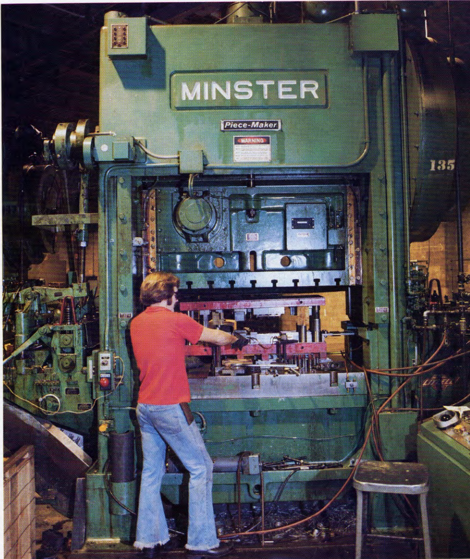
Another die is set in one of Reichert Stamping's newest P2-150's... one of eight Minster P2's in the company

Until 1968 Reichert Stamping Company, Toledo, Ohio, did not have any presses over 60 tons capacity. Then, they decided to expand their capability with 150 ton presses. The excellent performance of a Minster Piece-Maker® P2-60 automatic production press purchased in 1955 and two B1-45 high speed presses installed in the mid-60's led the firm back to Minster in 1968. Following their philosophy of always having a back-up press of equal capacity, they bought two Piece-Maker P2-150 presses... one for immediate delivery from stock and one for later delivery.