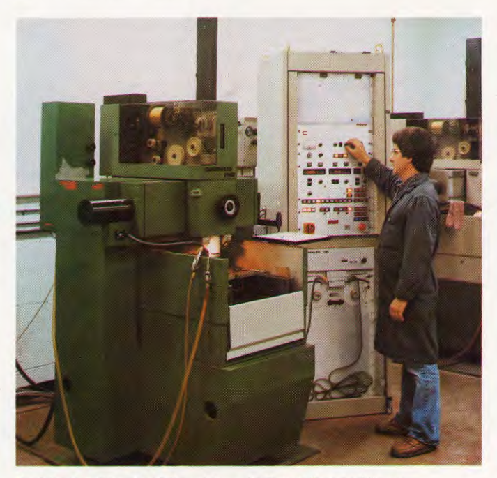
Precision traveling wire EDM machines at Interlock Technical Center.

If you're involved in high speed, precision stamping, you can't afford not to investigate the Pulsar . Its unique combination of high speed and consistent accuracy can help you gain a competitive edge.