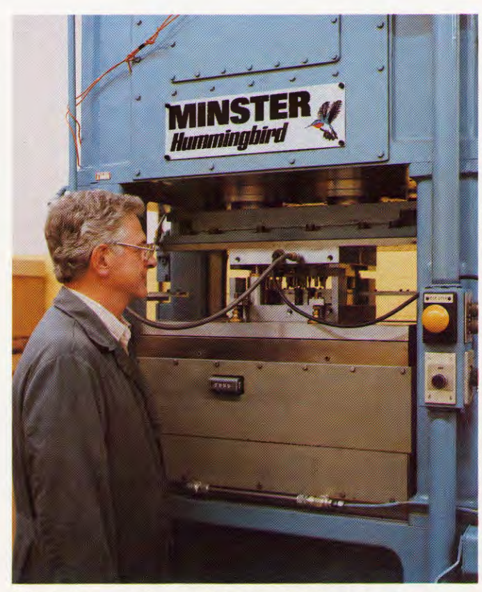
A Minster Hummingbird is used at Interlock Technical Center for die tryouts.