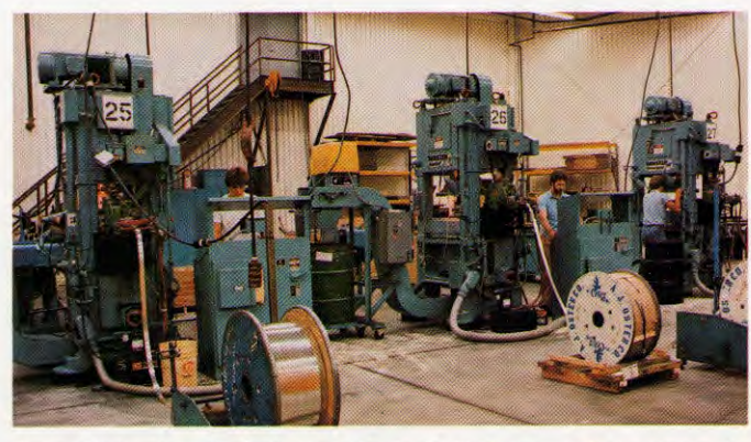
These Minster Hummingbirds were Interlock's first stage in their program to increase press productivity.

"Another example of the advantages of the Pulsar's speed capability shows up on a job we're running that requires 127,000,000 parts per year. That kind of production previously utilized six dies; with the Pulsars we need only three. In fact, on a recent run in one of our Pulsars we were able to produce 590,000 parts from a one-out die in a single 10-hour shift, averaging in excess of 1100 strokes per minute of press running time."