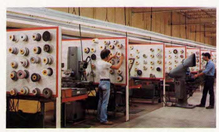
Interlock Technical Center provides tool design and construction services.

Interlock Technical Center in Brecksville, Ohio, provides tool design, contruction and die tryout for Interlock Terminal and its many customers. The comprehensive facility, along with the capability and ingenuity of its people gives Interlock an additional competitive edge. Together with Interlock's high volume part production ability, the Brecksville facility adds another problemsolving dimension to keep Interlock "the one to beat."