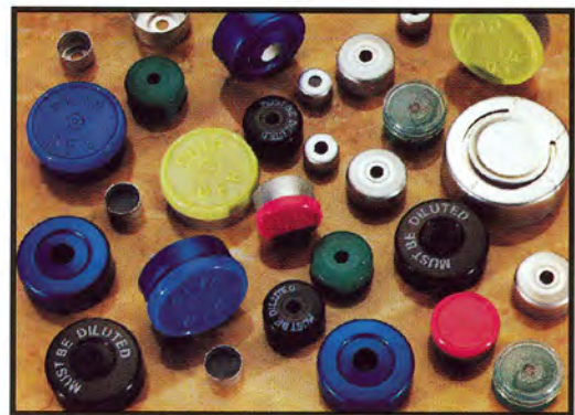
The West Company supplies the pharmaceutical industry with closures such as these in a vast array of sizes and quantities.

West also plans to continue their stay at the top of the pharmaceutical stamping industry. "With the support of Minster and the high quality stamping we produce, I know our partnership will continue to flourish."