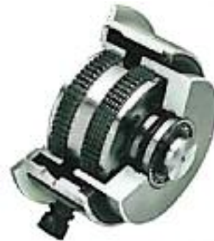
Air-Actuated Wet Clutch (Built Into Flywheel)