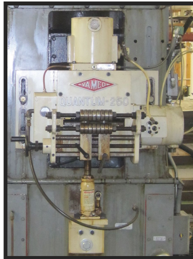
Photo of actual machine

New 1980 - Remanufactured 2003 Nidec Press & Automation Stock #100249P