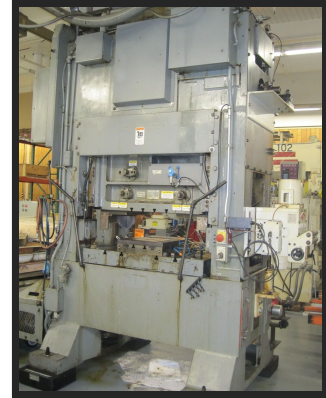
Photos of actual press, prior to removal