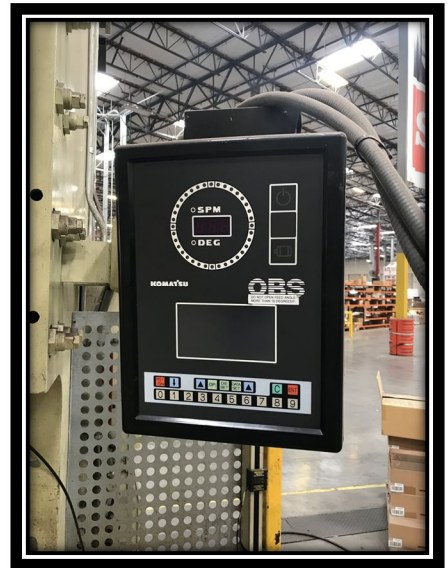
Photos of actual machine