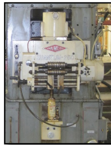
Photo of actual machine